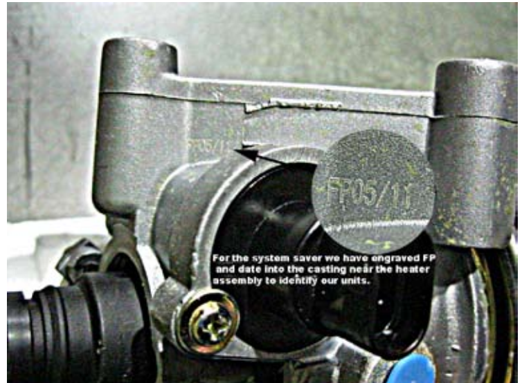
R955205 (System Saver)

Questions can be directed to our technical staff at 877-243-0442.